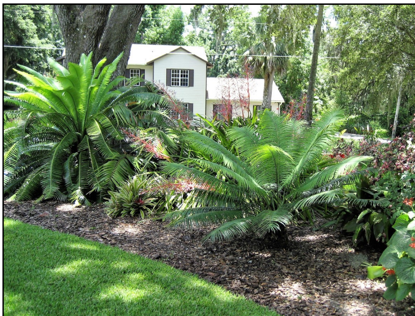
Encephalartos ferox, Cycas robusta, and C. wailailak at chez Walworth. Neighbor's house in back.