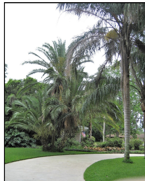
Center, Phoenix dactylifera, the true date palm, in Oviedo.