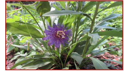
Flowers at Mead—Passionflower