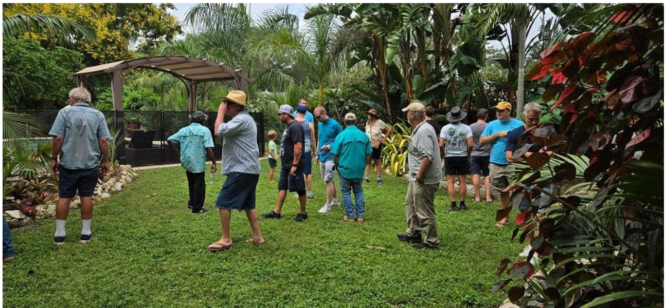
Y'all sure we're still in Central Florida?