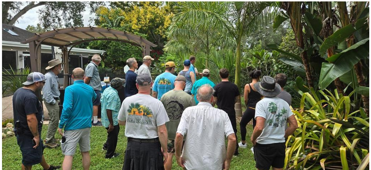
Roystonea regia and Beccariophoenix alfredii – the new royalty of Central Florida.