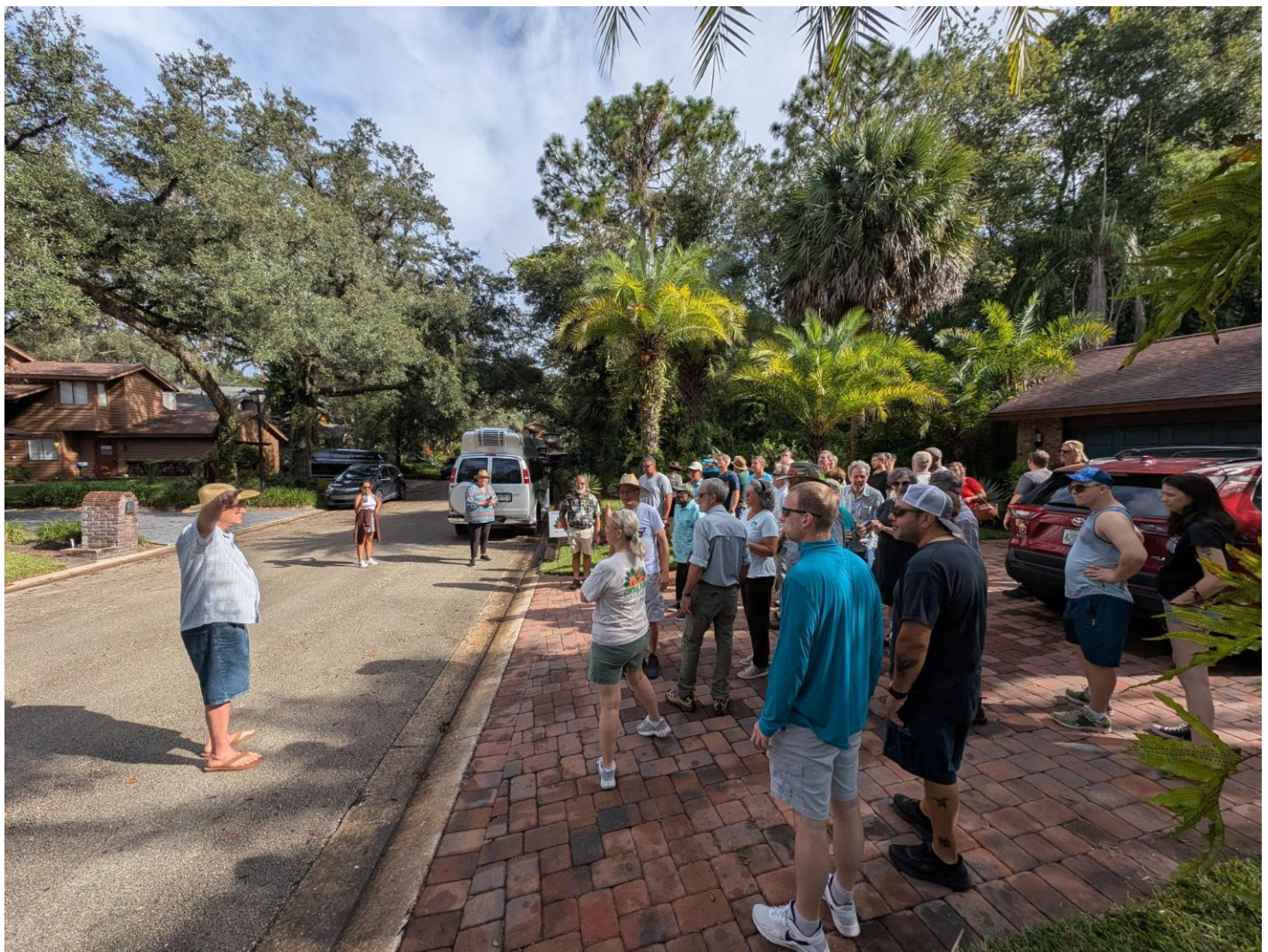
The host addresses attendees before the tour.