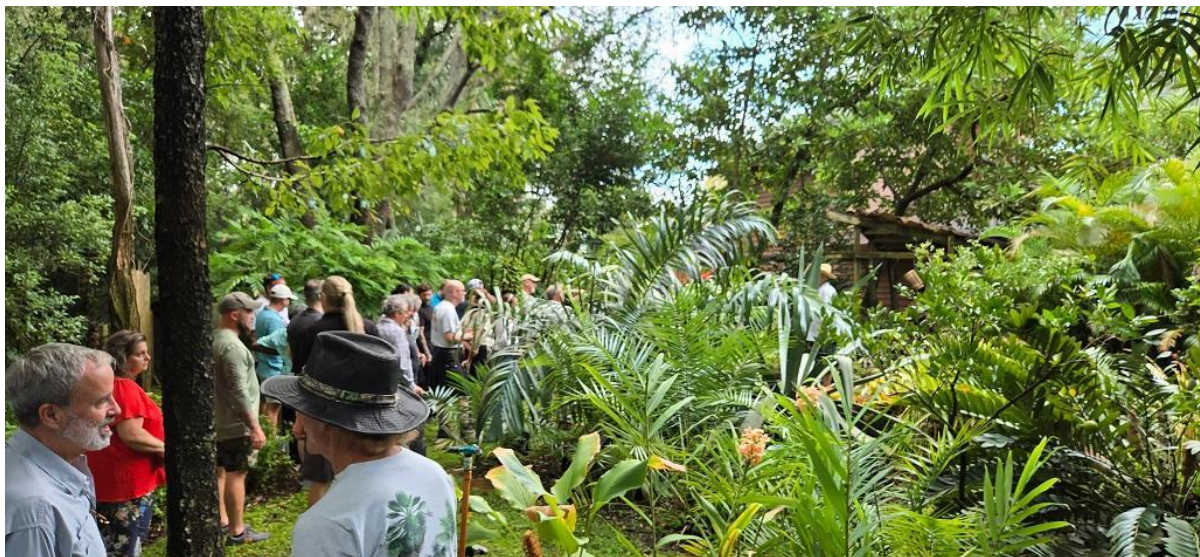
Everyone gets lost in the woods.