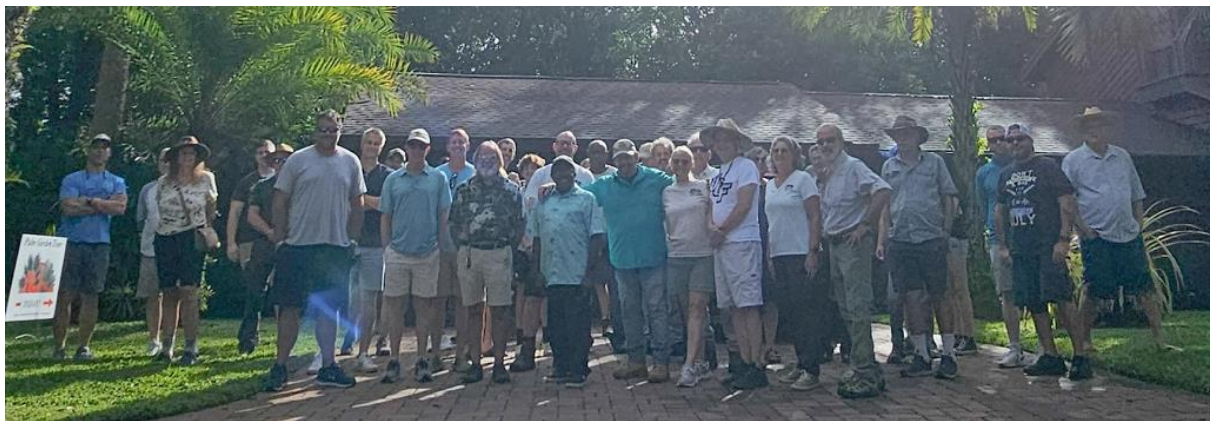
Group photo at the first site.