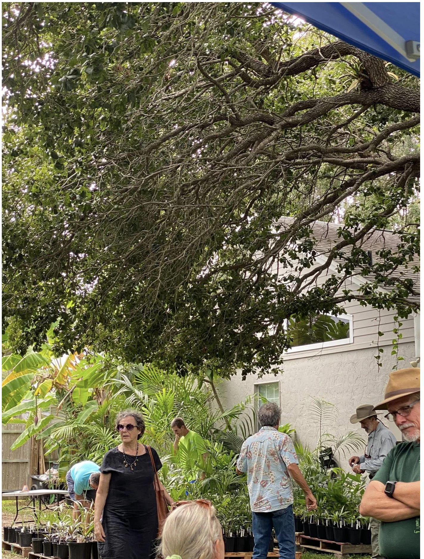
Attendees packed both the front yard and the back yard to buy palms from vendors.