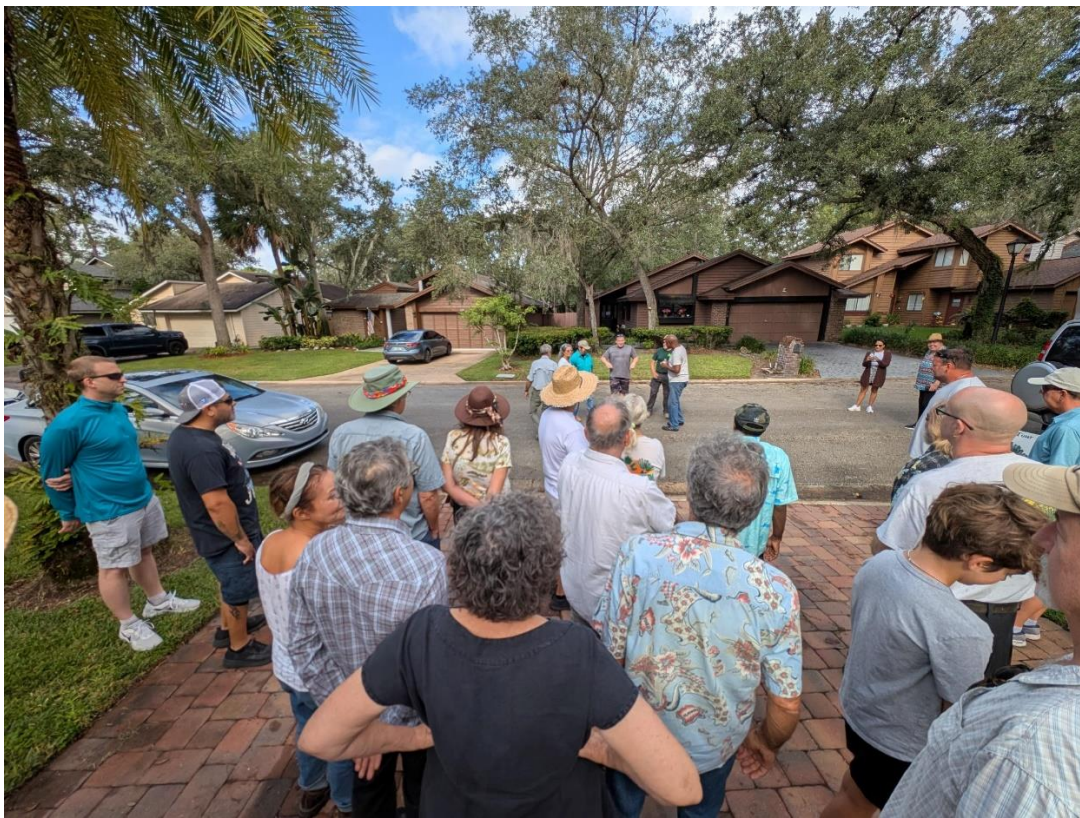
Both seasoned veterans and new members meet the CFPACS Board of Directors.