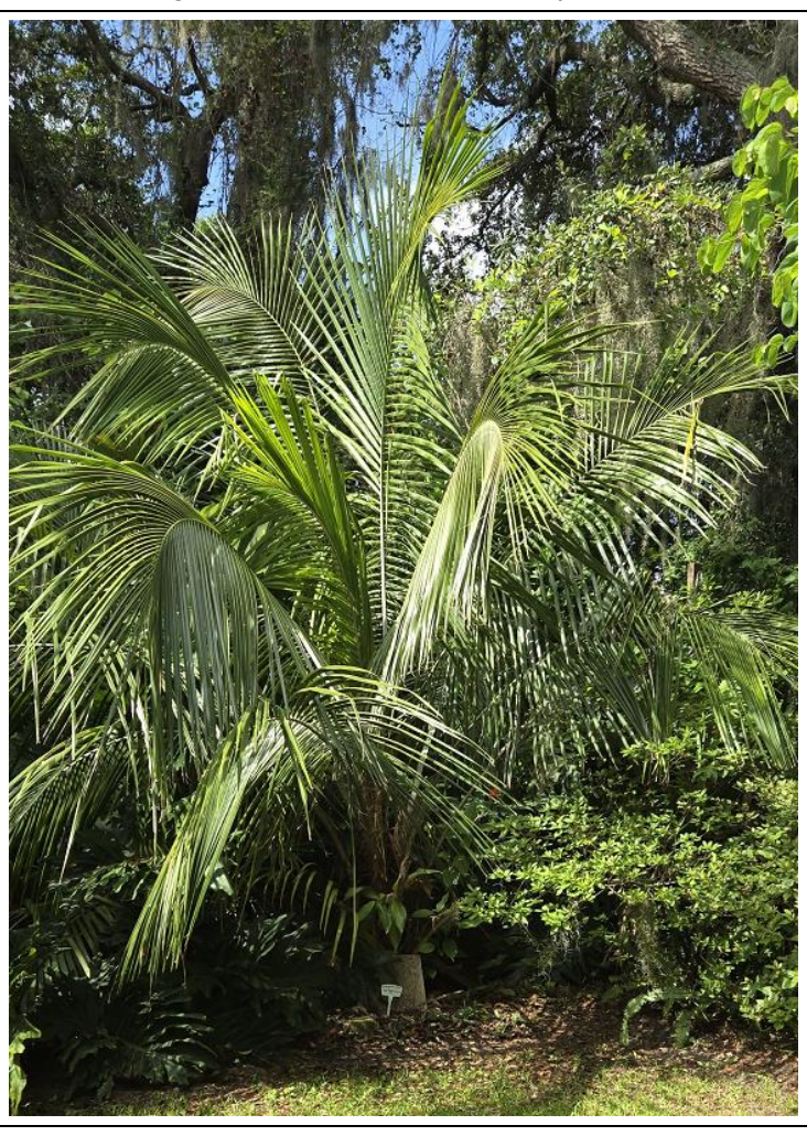
One of the many Beccariophoenix alfredii in Lou's Garden.