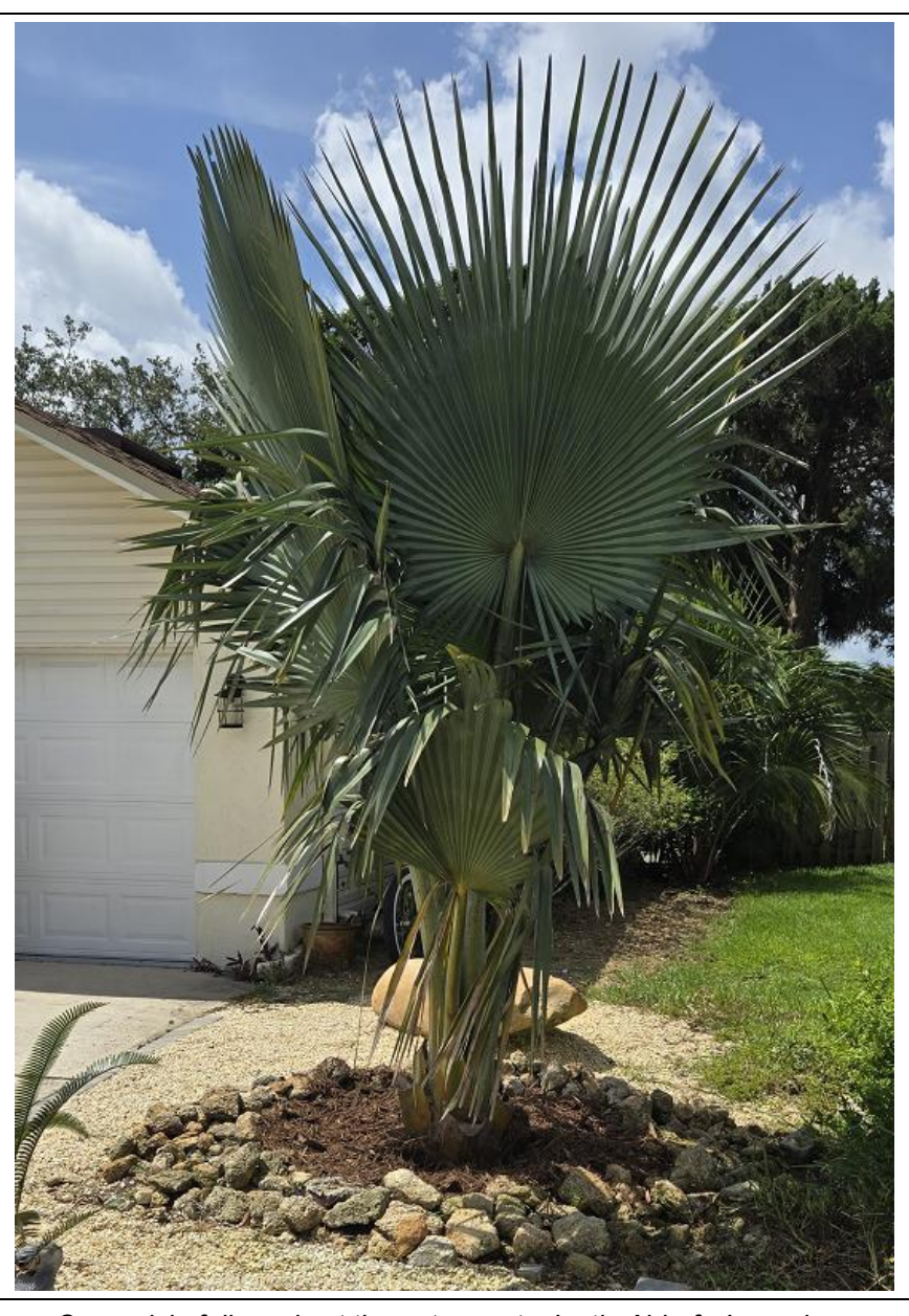
Copernicia fallaensis at the entrance to Justin Alderfer's garden..