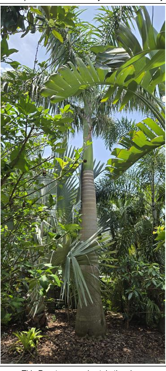
This Roystonea regia stole the show.