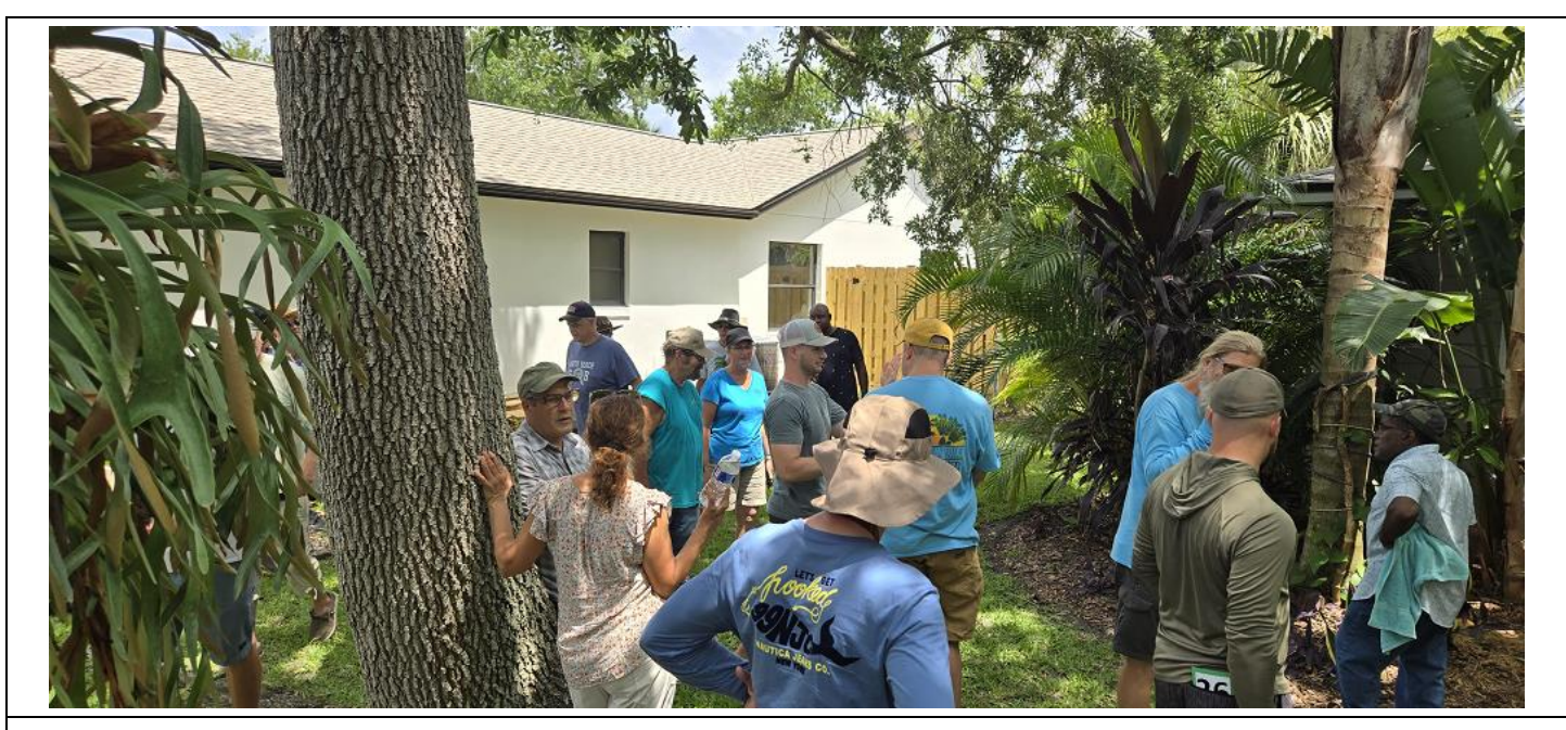
Attendees packed both the front yard and the back yard.