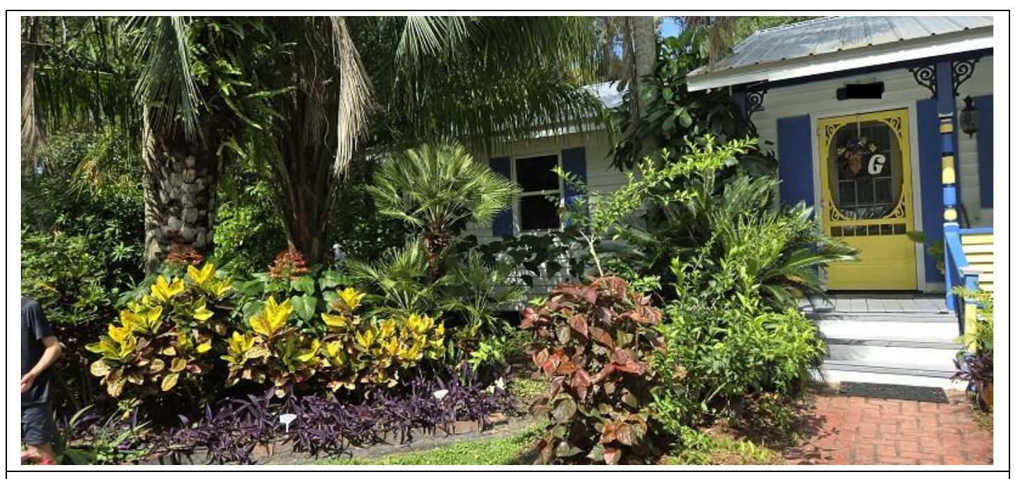
The entrance to the garden of Lou Greco.