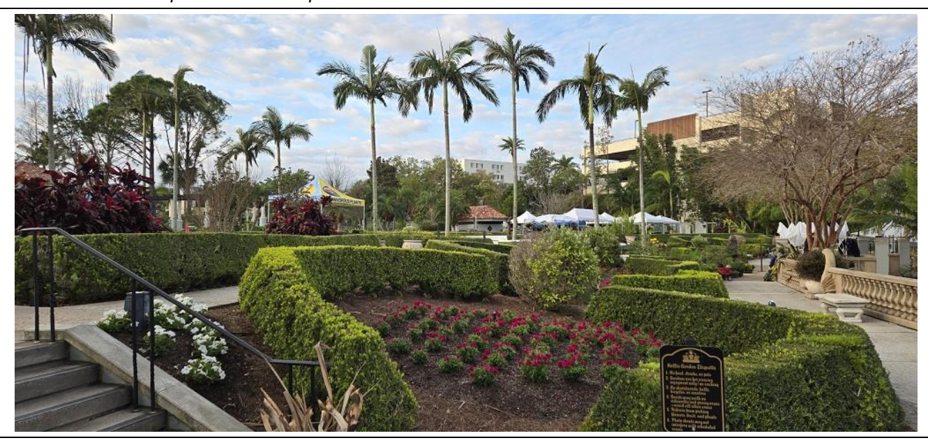
The vendor tents in the center of the garden sit below rows of Archontophoenix alexandrae.