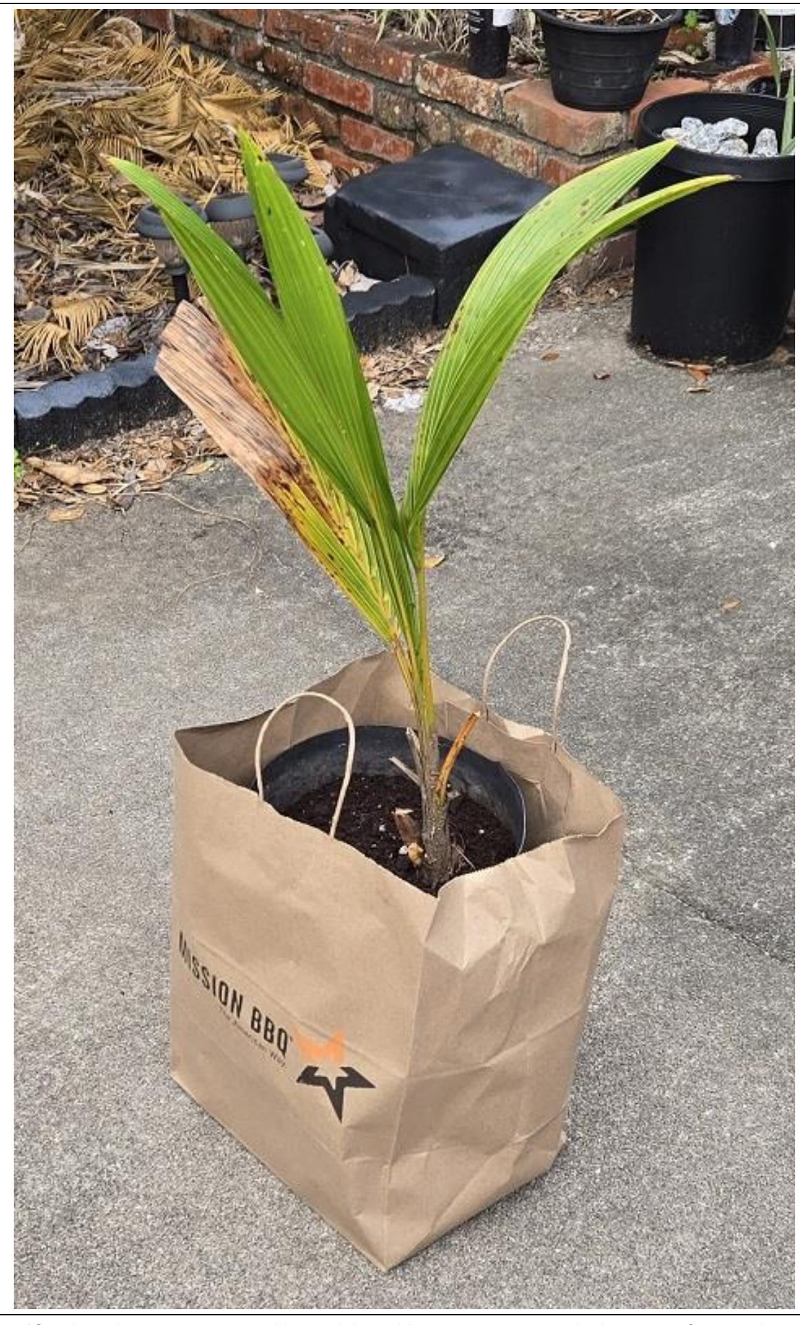
After the sale, a patron stopped by to pick up this young coconut and take a tour of my garden.