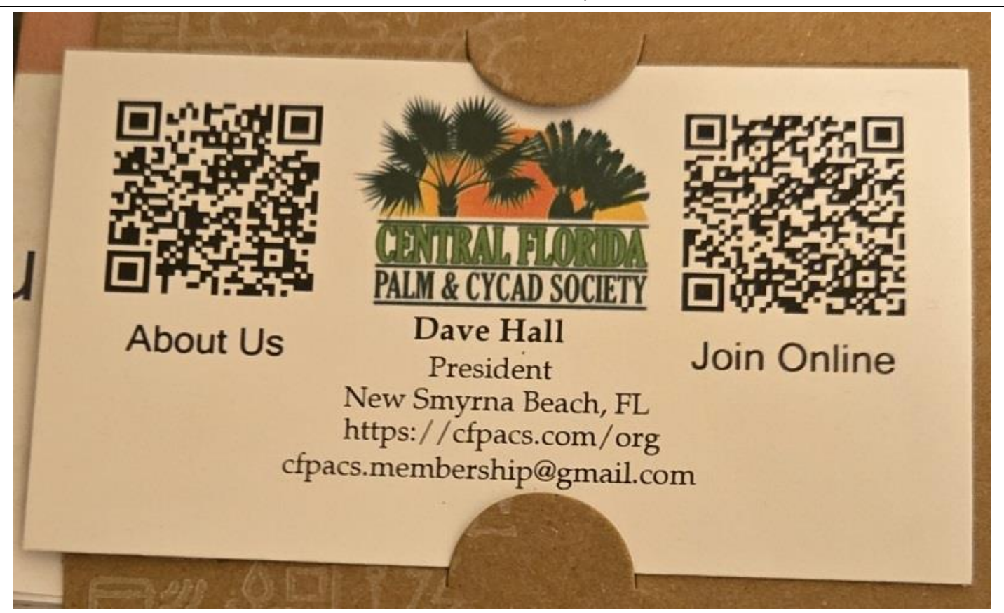
These are the business cards we test marketed at the sale. The QR codes were a big hit with mobile phone users.