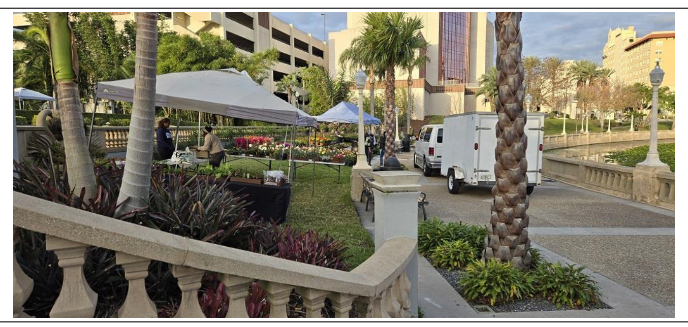
Additional vendors set up on the promenade, with Livistona saribus and Archontophoenix teracarpa nearby.