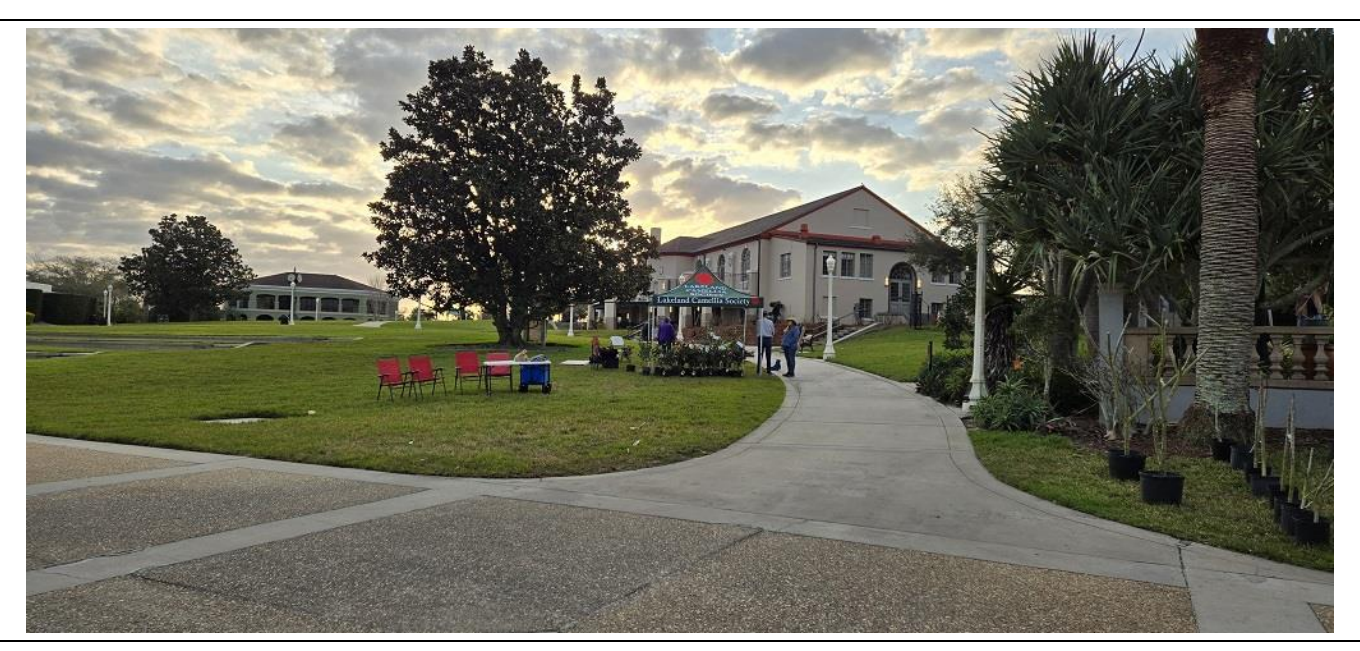
Every journey starts with a single step. The chairs and one table sit at our booth site at 7:30AM.