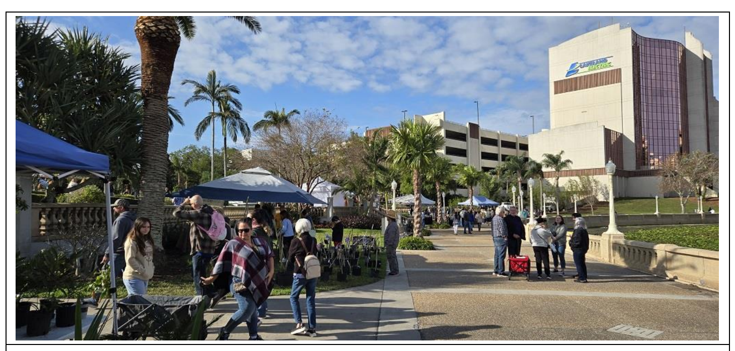
Patrons flood the booths on the promenade.